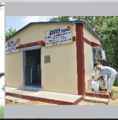
HYGIENE & SANITATION