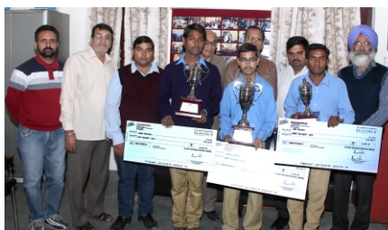
Scholarship Winners Mathra Das Anglo Sanskrit Sr. Sec. School, Moga

The first 3 position holders at both schools were awarded their trophies, scholarship cheques and certificates.