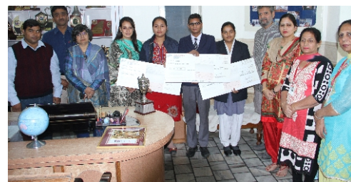
Scholarship Winners Arya Model High School, Moga