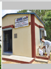
HYGIENE & SANITATION