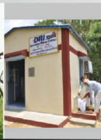
HYGIENE & SANITATION